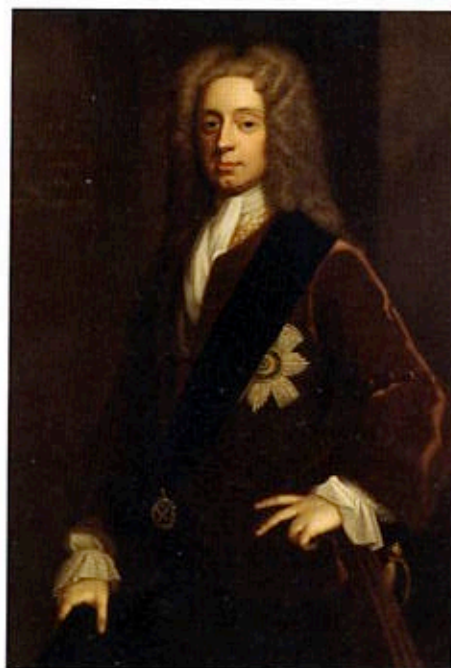
1: Charles Boyle (1674–1731), the Fourth Earl of Orrery, possibly after Charles Jervas (1707).

The Armagh Observatory Human Orrery is the first major addition to the Observatory grounds and Astropark for more than a decade. This is believed to be the first large outdoor exhibit designed to show with precision the elliptical orbits and changing relative positions of the planets and other solar system bodies versus time. The Human Orrery provides a dynamic map of the positions and orbits of the six classical planets, an asteroid and two comets, as well as an indication of the 13 zodiacal constellations through which the Sun passes in the course of a year, and pointers to more distant objects in the universe. This article describes the key features of its design and construction, and indicates how educators may use the exhibit as an innovative tool to communicate astronomy, mathematics and space science to people of all ages.