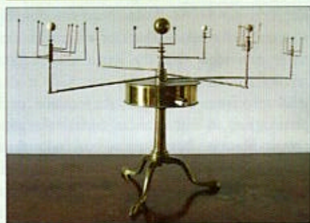
2 (top): One of the first orreries ever made, this device was the first to be called an orrery. It was commissioned to John Rowley by Charles Boyle, the Fourth Earl of Orrery, c. 1712, and presented to his son John (later the Fifth Earl of Orrery).