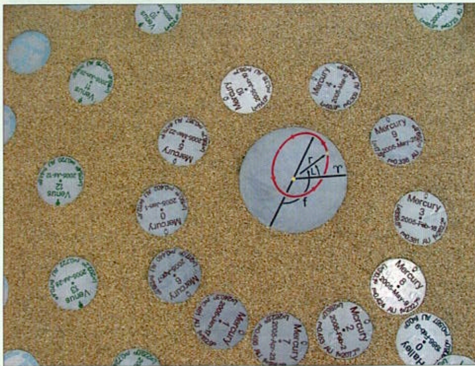
4 (right): Aerial view of the centre of the Human Orrery at the Armagh Observatory, including the Sun-tile with key.

an orrery should be called a "Graham", but the word does not slip so lightly off the tongue, and the first example was in any case only a simple model showing the Earth-Moon system orbiting the Sun. Graham gave the first model (or its design) to the celebrated instrument maker John